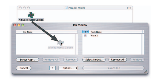
Figure 1. Using the cluster. To set up a parallel computing job, the user drags a parallel application, in this case the AltiVec Fractal Carbon demo, and drops it in Pooch's Job window.

Next, the user chooses nodes to run in parallel. By default, Pooch selects the node where the job is specified. To add more, the user clicks on Select Nodes..., which invokes a Network Scan window,